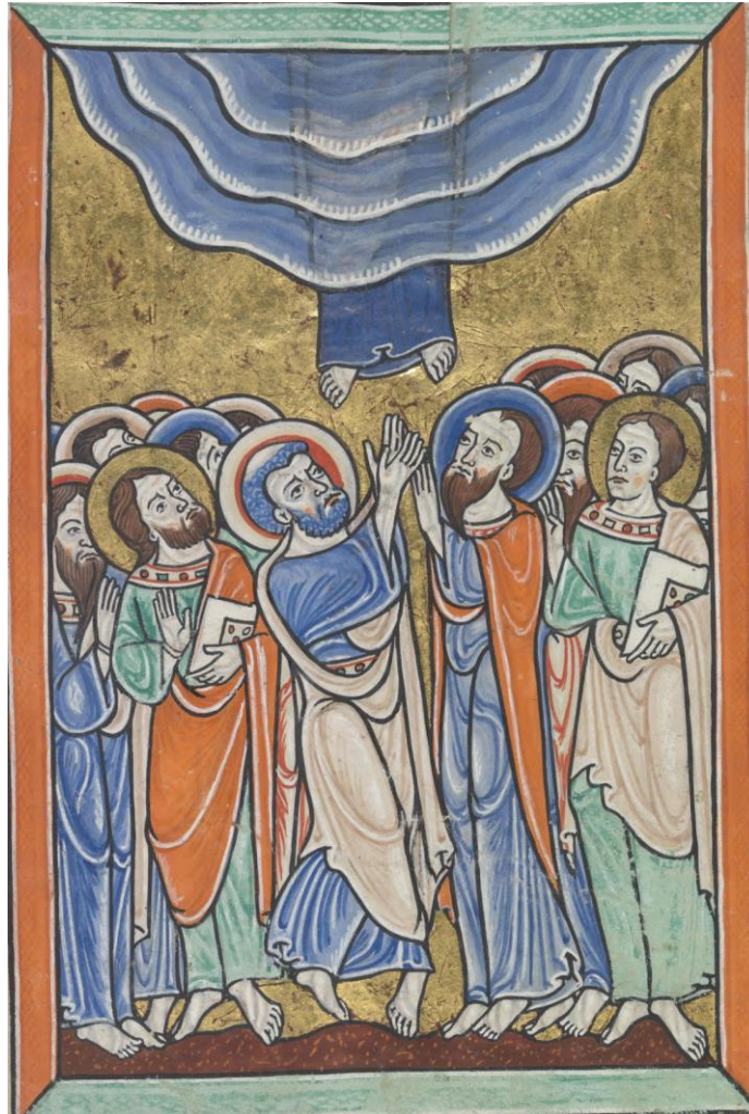
Christ Ascends, Psalter of Eleanor of Aquitaine (ca. 1185)